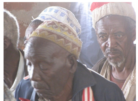
Muslims realize the blessing of having a Christian church in their area as they stand in line to receive food

We are a little sore from bouncing around in a SUV for 3 days, but very grateful we could be a part of this much needed famine relief project.