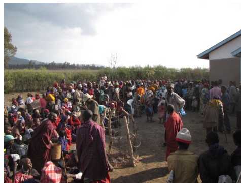
800 to 1,000 people wait at Ol Doinyo Sambu church for a small portion of food

Day 2: Because of loading delays and a flat truck tire it