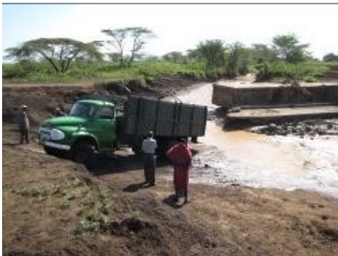
A truck becomes stuck after barely crossing the river.

Sadly, after a couple hours of waiting I decided to turn back. The risk of damage to my low clearance 4-wheel drive vehicle was just too great. The good news is that the truck hauling the famine relief food had left the night before, so the distribution of much needed food took place, but without us.